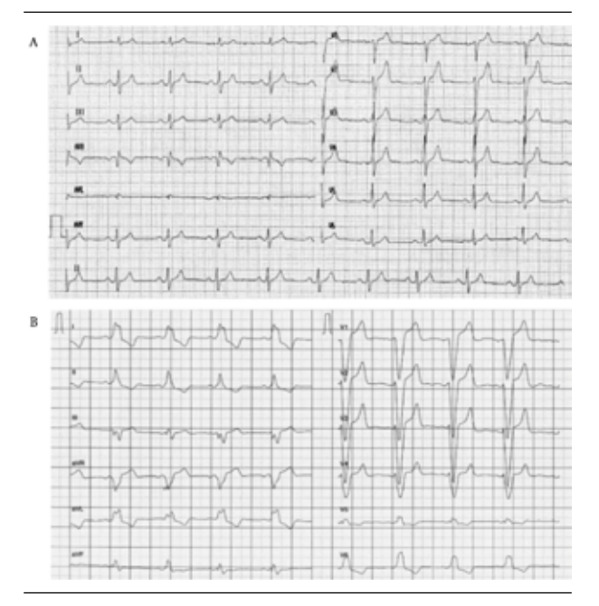
Figure 2. Surface Electrocardiograms of a Patient Before (A) and 2 Days (B) After the Implantation of a CoreValve (A)

The non-coronary cusp calcification extends to the subvalvular regions, where the conduction system is located within the triangle of Koch.