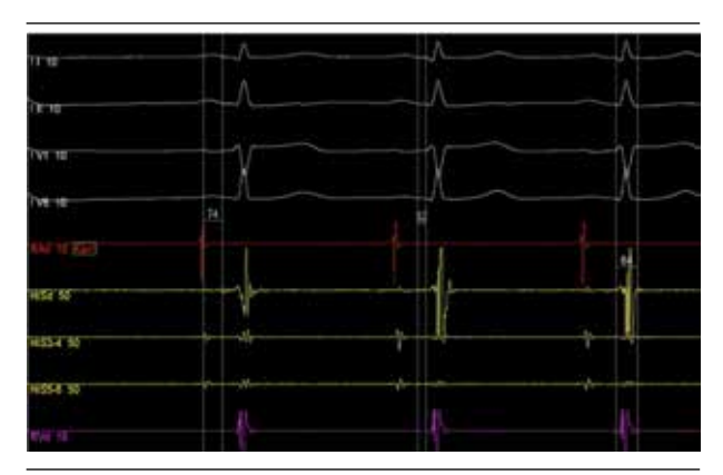
Figure 4. Intracardiac Traces in a Patient with Normal AH and HV Conduction